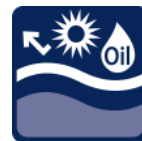
Sun Creams and Oil Resistant