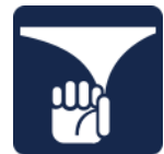
Two Way Stretch