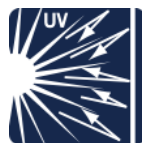
Excellent UV Protection