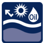
Sun Creams and Oil Resistance